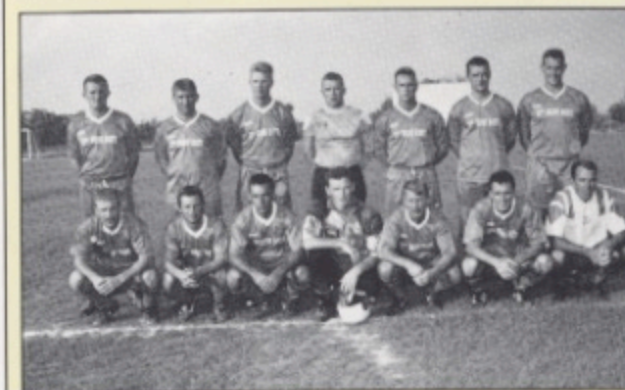
The UNIFIL Soccer Team

On Sunday 2 October, UNFICYP played the 75 Inf Bn (Irish) UNIFIL team in a soccer match at the UNPA playing fields. The 75 Inf Bn are currently the UNIFIL league and cup winners.