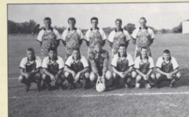
The UNFICYP Soccer Team

Two games were played by the Irish whilst in Cyprus. The photographs show the two teams who played out a competitive, skilful and entertaining game before a sizeable crowd.