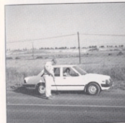
Yes Sir, you've passed your MOT test!

First blood went to the 'terrorists' when they succeeded in planting a 'bomb' at the MP HQ. This necessitated the HQ's evacuation and closing of the Old Airport Road. Their jubilation was