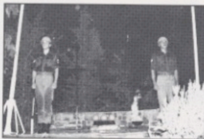
The memorial place at Goshi.