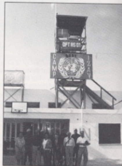
The whole group in front of OPT AS-01