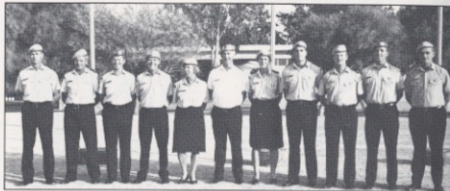
The medals/numerals recipients.

the remaining ten members on parade received their No 2 numeral.