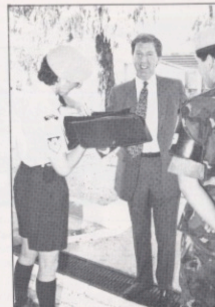
Nobody, but nobody, gets away with it!

short-lived, however, as the evil-doers responsible were quickly apprehended and delivered to justice! Throughout the morning, the cat and mouse contest continued, with disappointed 'terrorists' falling into the clutches of the good guys at regular intervals.