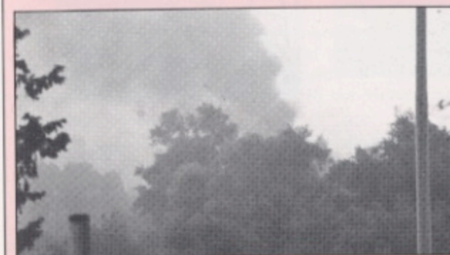
A view of the fire near ARGCON's HQ at Skouriotissa Camp.

and the situation became more critical as huge flames and dense smoke columns rose into the skies, illustrating a very sinister picture. The wind, which fought against the efforts of Greek Cypriot and WBSA Fire Brigades, Civil Defence and the ARGCON men, framed what seemed to be the following logical step: the evacuation of what had become our second home, Skouriotissa Camp.