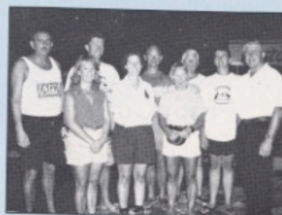
The FOWO and the organising committee

A great night was had by all, and many thanks go to all those who attended.