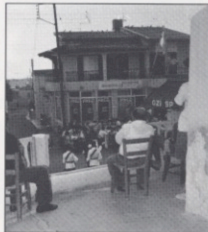
View from Turkish Cypriot coffee shop facing HQ IRCIVPOL.

After the presentations, the recipients and guests were led