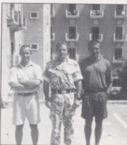
Two of the R and R cell, wondering why the third isn't in uniform...

Some of the more unpleasant jobs have involved travelling the island's holiday and negotiating "special UN prices" with the Hotel Managers. This can be quite tricky when competing with the European travel companies. In addition, all the beaches had to be checked out, with Nissi beach having been done several times. How else can we advise our customers on a particular resort?