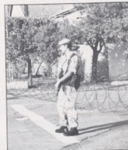
A vigilant guard.

The last act was a disturbing report that all terrorists had succeeded in infiltrating the Austrian Mess, where they had taken possession of a large amount of (well deserved) refreshments! Taking their cue from the bad guys, the MP Element quickly retired to the MP Lounge on stand down. After all, doing good is thirsty work!