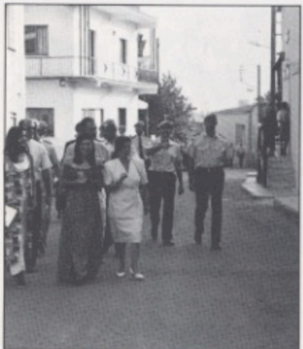
Members of IRCIVPOL and local residents in the streets of Pyla.

The event was staged at the local football ground, with the reception being held at the IRCIVPOL Headquarters in Pyla. Two members of IRCIVPOL were presented with the United Nations medal, and