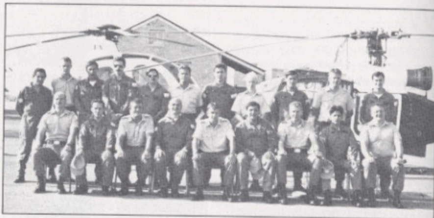
The outgoing British AAC Flight and the incoming Argentine Air Force.

Since that moment, the whole group dedicated its time and efforts to theoretical and practical instruction provided by personnel