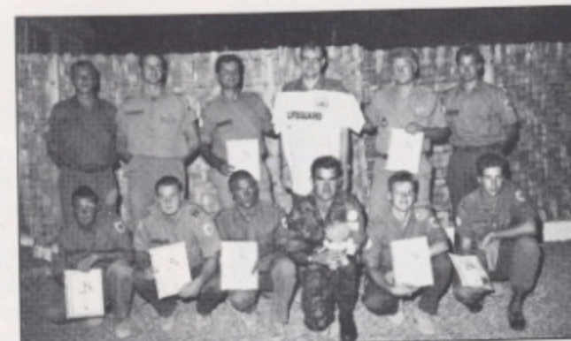
Rescue techniques being tested.