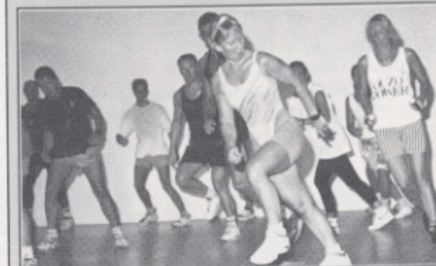
Come on, follow me and keep up!

The UNFICYP Force Commander among some happy faces from the SBA