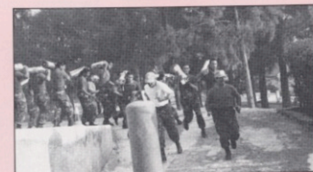
ARGCON men in action.

Suddenly, a fire, which originated in the Petra Valley, spread quickly and caught the attention of those of us who happened to be around. We were naturally concerned about the destiny of our Headquarters! First, the fire alarm sirens sounded, and Sector One personnel rushed to accomplish their tasks, as per UNFICYP's fire fighting procedures. Time literally flew,