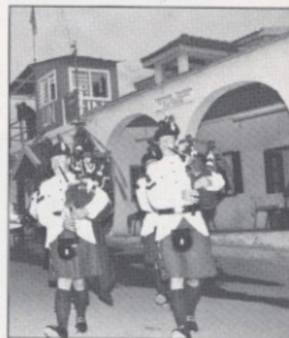
The band of the RIR, parading through the streets of Pyla.

band continued their fine display of music for the people of Pyla, playing in the village square a selection of military marches.