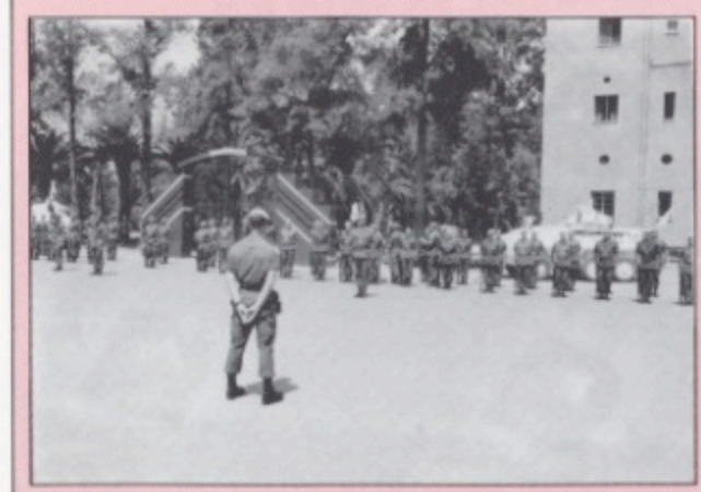
1 RCHA takes over command of Sector Three from the 2nd Bn R22eR.

A Change of Command Parade marked the handover of Sector Three from the 3rd Battalion Royal 22nd Regiment to the 1st Regiment Royal Canadian Horse Artillery. There were two guards made up of the R22eR and 1RCHA respectively with the usual exchange of gifts and the raising and lowering of unit flags.