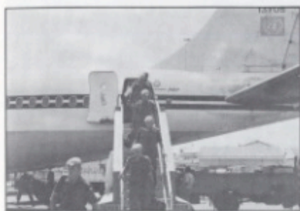
1 RCHA arrives in Cyprus

During the month of August, three flights brought the soldiers of the 1st Regiment Royal Canadian Horse Artillery to Larnaca Airport. Remaining home in Canadian Forces Base Shilo, Manitoba is the Rear Guard comprised of one battery and a garrison troop.