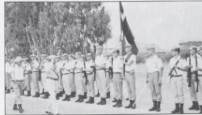
The FC salutes the Colours

The personnel in DANCON would like to thank all participants for a wonderful day - one which they will never forget.