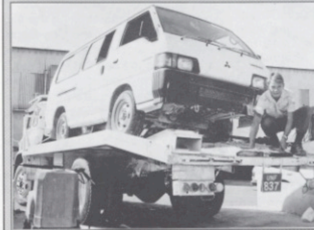
Bedford Platform Recovery Vehicle with Cpl Porter

The Recovery Section is a vital part of the UN Workshops, and is situated to the rear of the Support Regiment Workshops in Jubilee Camp. The primary job of the NCO i/c, Cpl Porter, and the 2 i/c, L/Cpl Mackleden, is the recovery of all UN vehicles which have been involved in traffic accidents or which have just broken down.