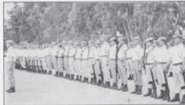
B Coy listens to the FC's speech