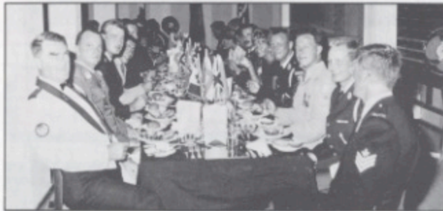
MP Coy members and guests

The UNFICYP Military Police Company recently held their annual Dining-In Night. The function was held at the Ledra Palace WOs' and Sgts' Mess, and was attended by 70 members of the MP Coy with their ladies and members of the Australian and Swedish Civilian Police. Our guests of honour were the DCOS, Col