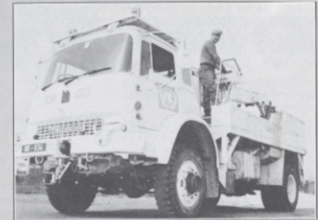
Bedford Recovery Vehicle with LCpl Mackleden

During the summer period, when the weather is good, the number of recoveries is low. However, as the weather worsens, the recovery crew can expect to be called out to a greater number of jobs. In order to achieve a 24 hour recovery service, the Section shares a Duty Recovery Rota with the Force Scout Car's recovery mechanic, Cpl Hunter.