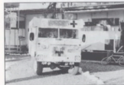
The Viking Camp infirmary

Since 1970, Viking Camp has been "home" for 44 Danish Contingents. The Camp is situated in Xeros, and the Cyprus Mines Corporation was a busy and dusty neighbour up until the events in 1974, when mining activities ceased.