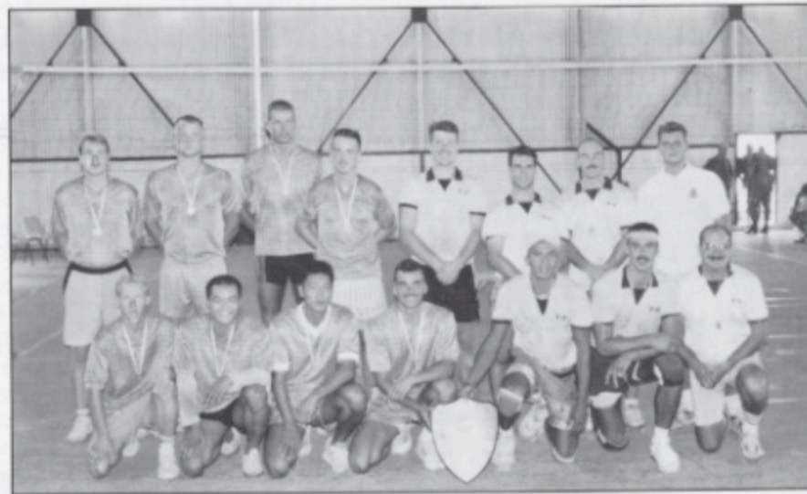
The Grand Finalists with the UNFICYP Volleyball Shield. CANCON (white) ran out winner against DANCON.

After playing six hard games, both finalists, CANCON and DANCON, made full use of the lunch break to rest before the gold medal match. The first game seemed to be going to the team