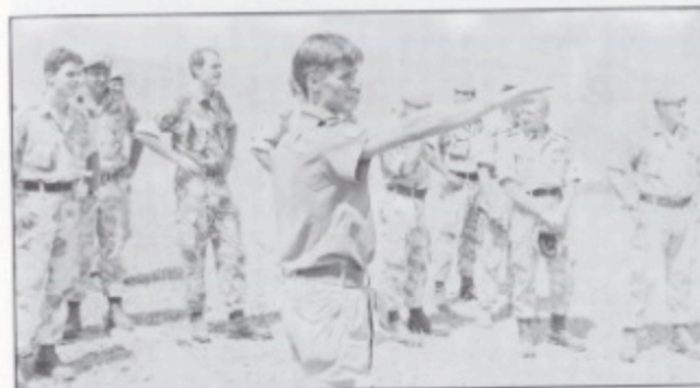
Sector Two soldiers being given a briefing by Sector One

A number of soldiers from Sector Two were recently invited to attend a familiarization tour of Sector One by the Danish Contingent. The soldiers toured the whole line of Sector One and were given first hand experience of what future UN British Contingents will be patrolling when the Danes pull out.