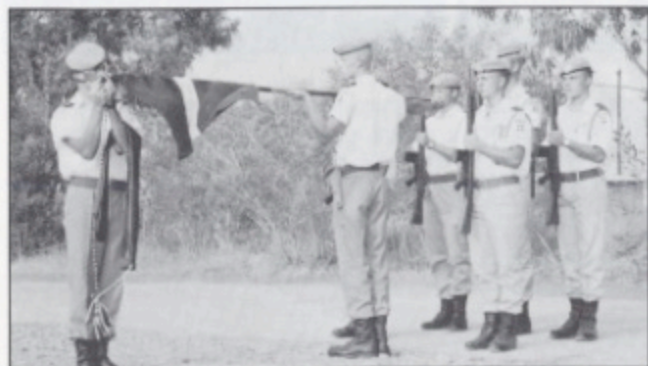
The Colours and the Colour Guard