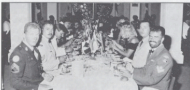
MP Coy members and guests