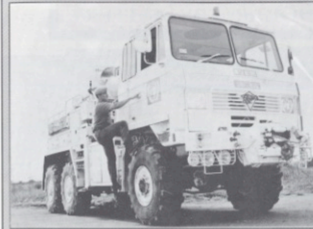
Foden 6x6 Heavy Recovery Vehicle with LCpl Mackleden

The Recovery Section is a vital part of the UN Workshops, and is situated to the rear of the Support Regiment Workshops in Jubilee Camp. The primary job of the NCO i/c, Cpl Porter, and the 2 i/c, L/Cpl Mackleden, is the recovery of all UN vehicles which have been involved in traffic accidents or which have just broken down.