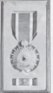
Liberation of Kuwait Medal, awarded by the Kingdom of Saudi Arabia.