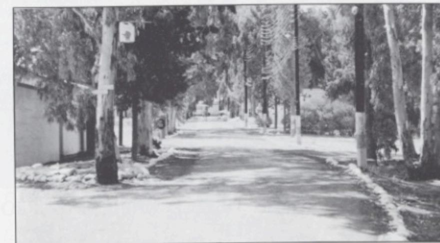
The main road in Viking Camp