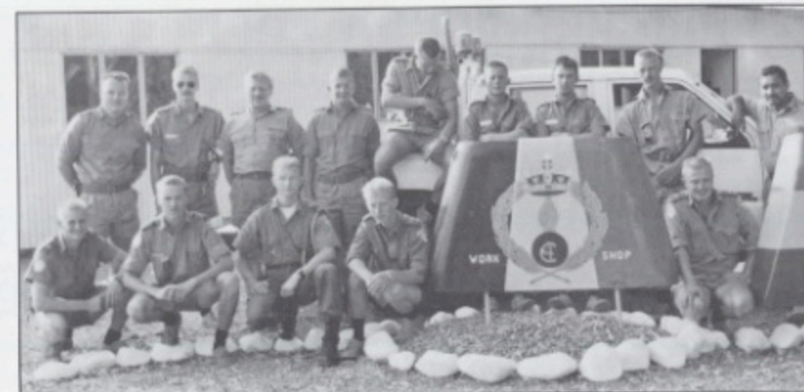
Members of the Workshop

Today, Viking Camp consists of 58 buildings, portable cabins, shacks and huts, providing offices and accommodation for HQ DANCON and HQ Coy.