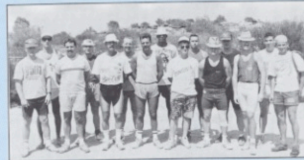
Members of Q Bty's sponsored run

Fifteen soldiers of Q (Sanna's Post) Battery recently took part in the 1992 Limassol Fun Run/Walk for Charity, organised by the Lions Club, Limassol. The route took them along the Limassol sea front, starting at the Old Port and finishing at Kolossi Castle. £75 was raised for the Muscular Dystrophy Research Trust of Cyprus.