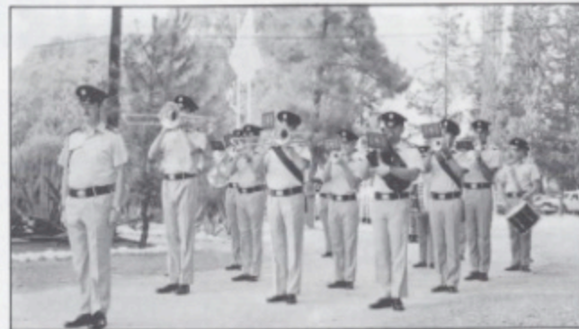
The band of the Worcestershire and Sherwood Foresters

The Danish Contingent recently held its 57th Medal Parade at which UN medals were presented to the soldiers of DANCON 57, the last full Danish Unit to serve in UNFICYP.