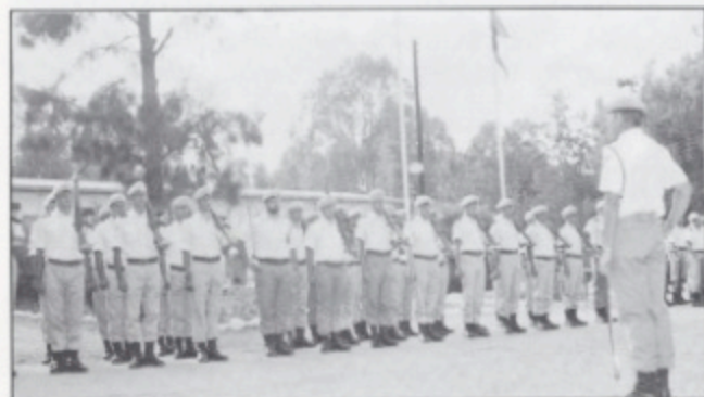
HQ Coy forming up

The Danish Contingent recently held its 57th Medal Parade at which UN medals were presented to the soldiers of DANCON 57, the last full Danish Unit to serve in UNFICYP.