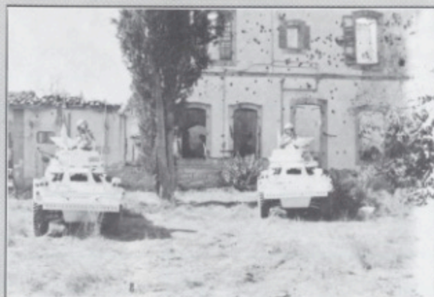
Lt Cook and Cpl Southern inspecting the Buffer Zone

The other major task of the Squadron is to command the Force Reserve, bringing under its wing a platoon from each contingent. A study day was held early in the month, followed by Exercise Pandora's Box two weeks later. The troops received a rude awakening early in the morning "crashing them out" to a meeting place in Sector Three. There then followed a series of communication and military knowledge stands and a crowd control demonstration run by the Australian Police, which enabled the different nationalities to get to know each other, and for the Cavalry to pit itself against the brawn of the Gunners.