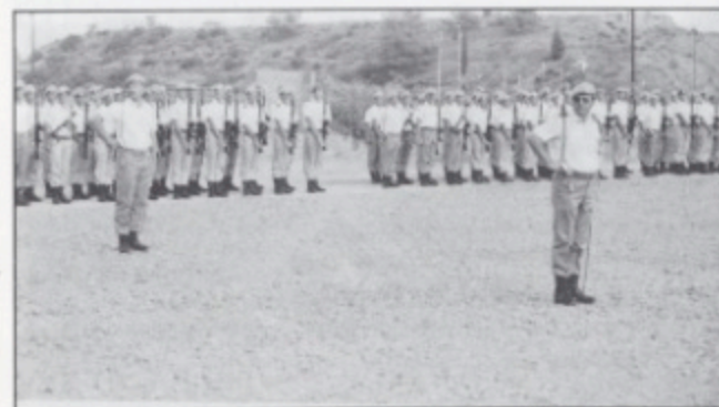
The parade awaits the FC

DANCON held a very good Parade under the command of Contingent Commander, Lt Col