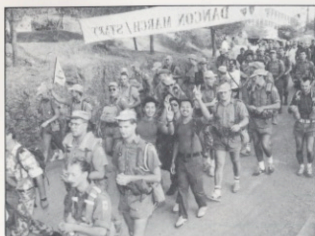
Only 25 km to go... a piece of cake!