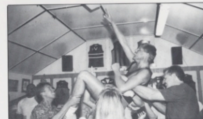
Commander SWEDCIVPOL at the AUSTCIVPOL Mess celebrating a well-earned win!