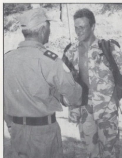
I'm sure glad I've finished.