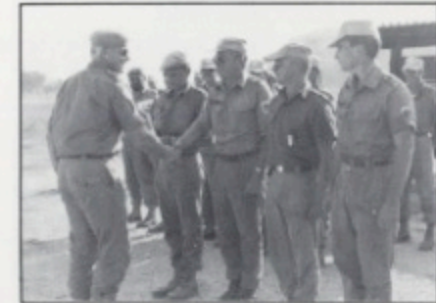
The winners being congratulated by the DCO