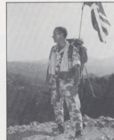
Now I've reached the top, where is the finish?

During the weekends 14/15 and 21/22 September, Sector One held the DANCON MARCH. 581 participants took part, and only 10 did not make it to the finish - a very good result! The route each day was 25km long, and people from the following countries took part: Denmark, Sweden, Norway, Austria, Great Britain, Canada, Finland, Cyprus, Ireland and Australia. Many bonds were made between people of different nationalities, who shared the suffering of blisters, wounds, aching muscles and very tired feet!