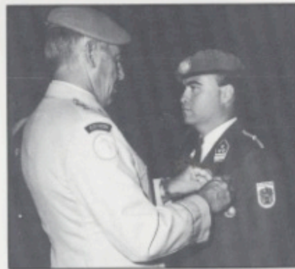
W02 Storch being awarded his 12th numeral by the Force Commander.