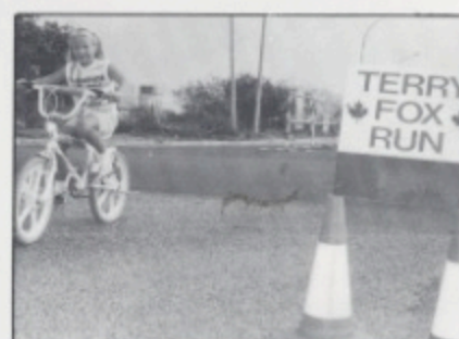
Which way did they go?

The Terry Fox Run was a resounding success. It was most satisfying to see so many nationalities