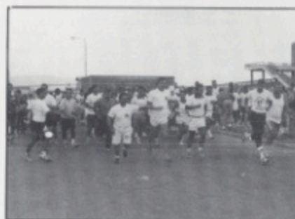
The run starts