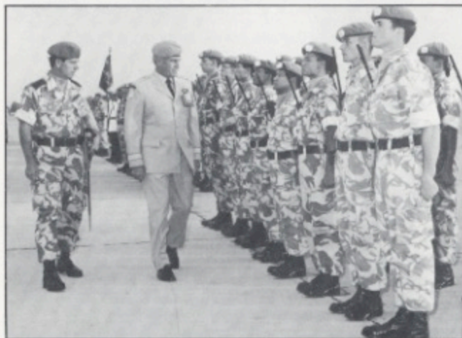
FC inspecting the parade