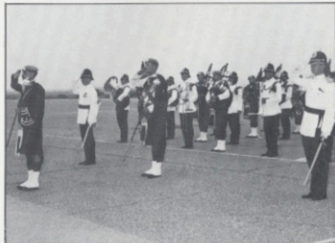
The massed bands