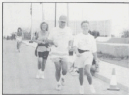
Hup- Two- Three- Four

and cultures unite for such a worthwhile cause. Without a doubt, Terry Fox would have been overwhelmed by the spirit which reigned on 5 October, and would also have been secure in the feeling that the Terry Fox Runs, which took place in some 38 countries this year, will some day be instrumental in beating cancer.