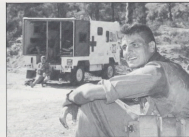
What? Still another 10 km...