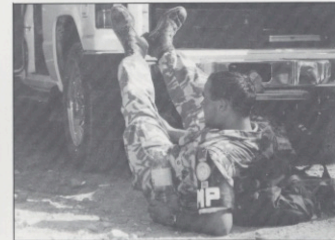
I wonder if there's a beer anywhere around here...?