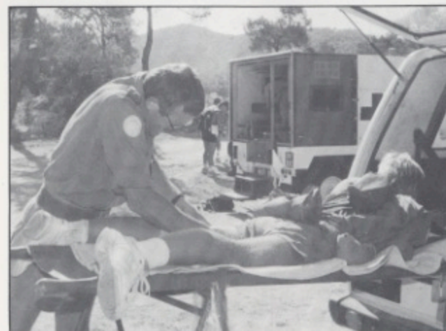
Is it still hurting?

During the weekends 14/15 and 21/22 September, Sector One held the DANCON MARCH. 581 participants took part, and only 10 did not make it to the finish - a very good result! The route each day was 25km long, and people from the following countries took part: Denmark, Sweden, Norway, Austria, Great Britain, Canada, Finland, Cyprus, Ireland and Australia. Many bonds were made between people of different nationalities, who shared the suffering of blisters, wounds, aching muscles and very tired feet!