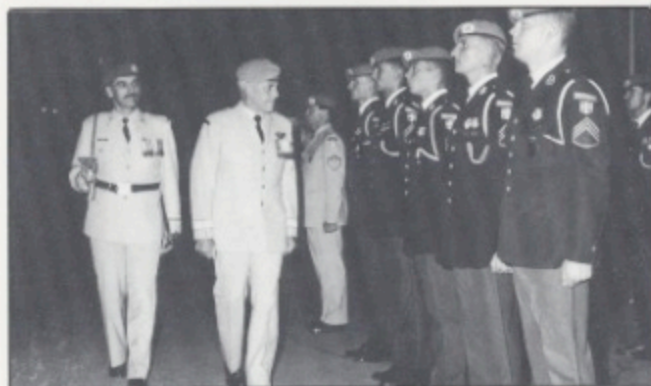
The Danish Military Police