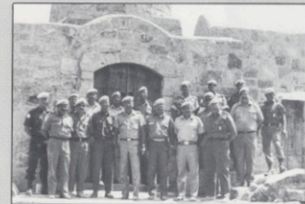
Hum Conference participants outside the church of Ayia Marina

On 3 September, Sector Four hosted the Humanitarian Conference at 2 Coy, situated in the Buffer Zone. 2 Coy's area of responsibility includes large areas of cultivated lands, bringing the Humanitarian Staff into close contact with local farmers and agricultural workers. Part of their duty is to attend village meetings to discuss any problems which may have arisen and to build up essential liaison and confidence.