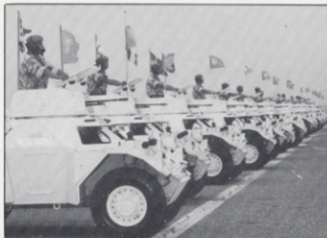
Ferret Scout Cars on the medal parade.

Finally, the Squadron took part in the BRITCON Medal Parade on the Old Nicosia Airport with all the Ferrets looking quite spectacular.