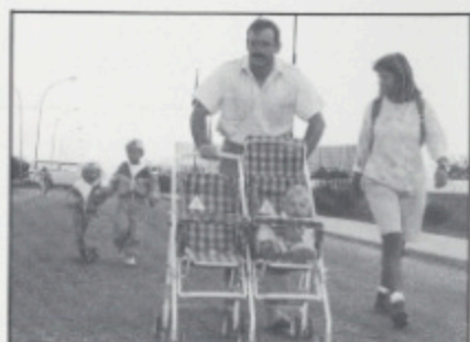
And the little ones came too