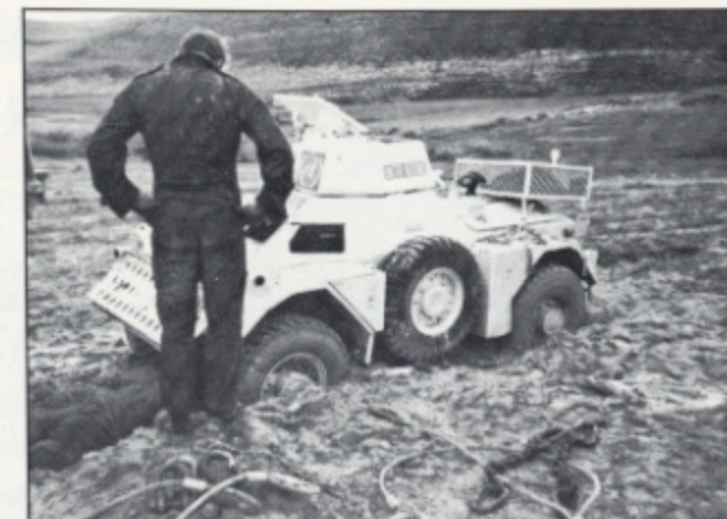
4Tp provide an interesting problem for the recce mechs, but where is Sgt Edge?

The Cross Country team managed an excellent second place in the UNFICYP Cross Country competition with Tpr Burkat coming in an overall second place. The Nicosia 10km Road Race gained the Squadron a highly respectable third place.