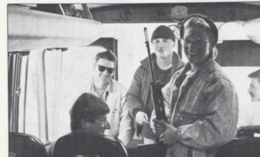
Some of the mock 'terrorists' and 'crew' aboard the '727'.

Similar exercises have taken place in the past and are part of UNFICYP's ongoing training programme.