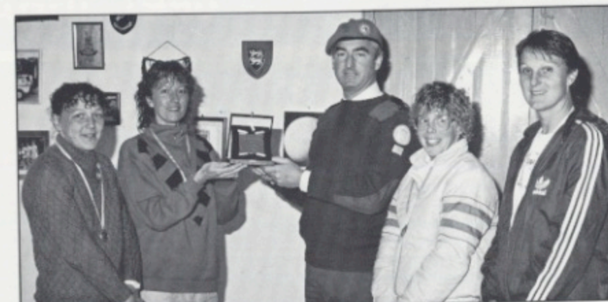
The winning ladies team from Ayios Nikolaos.

The team prize went to Sp Regt and the ladies team from Ayios Nikolaos beat three other teams from the Sovereign Bases.