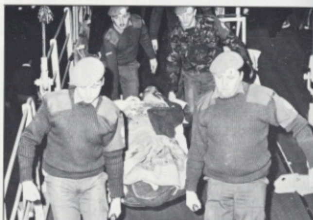
Larnaca Airport on 20th February with the assistance of UNFICYP personnel.