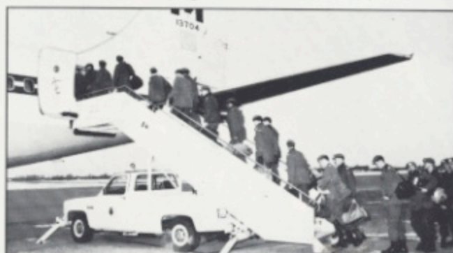
The journey begins 2PPCLI advance party departs Winnipeg on 20th Feb 90, bound for Cyprus.