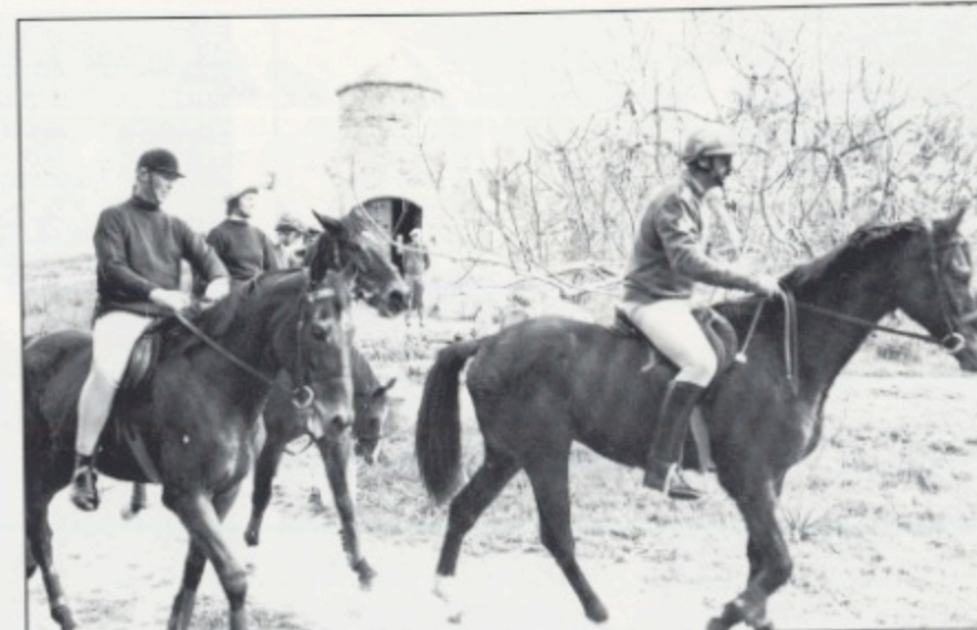
Nikolaos to AP A-28 over a 2 hour period which included stops for briefings. At OP A-28

the riders took care of the horses and had another briefing followed by lunch.