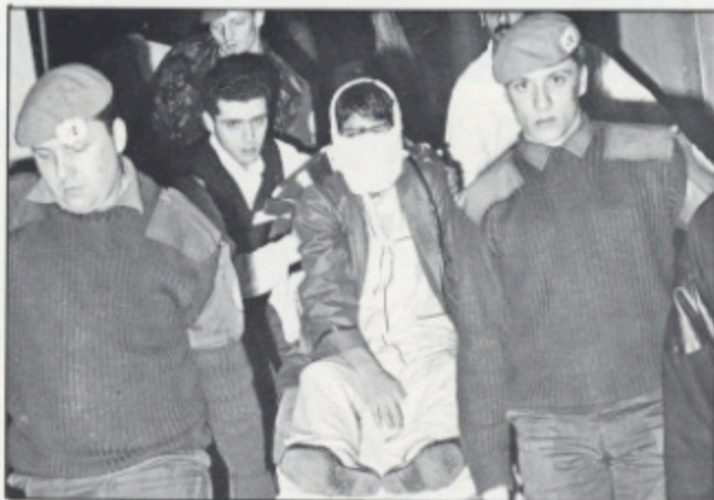
Injured Lebanese citizens in transit to Italy for medical treatment were transferred from a ferry to