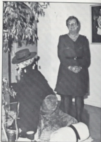
The swagman (left)