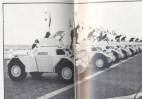
FSC mount up