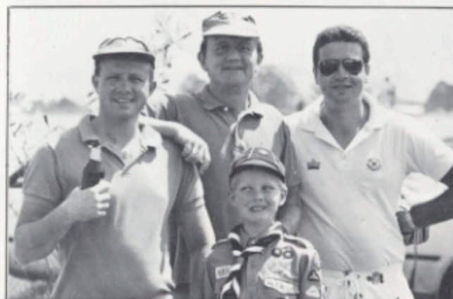
A good time was had by all