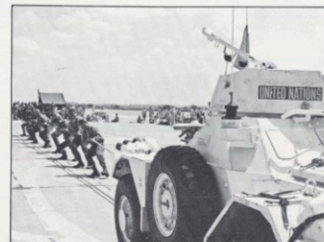
The Scout Car Pull