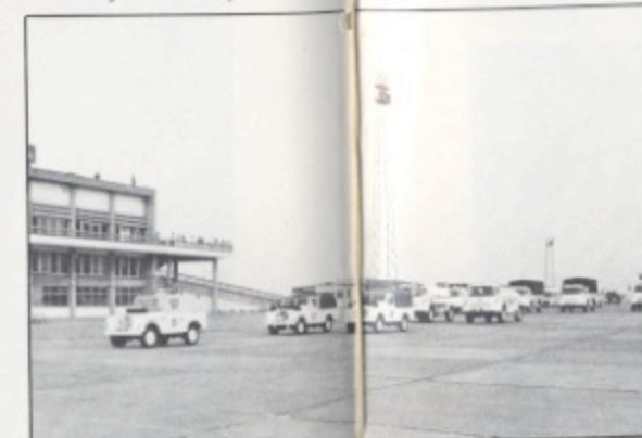
Transport Sqn on parade