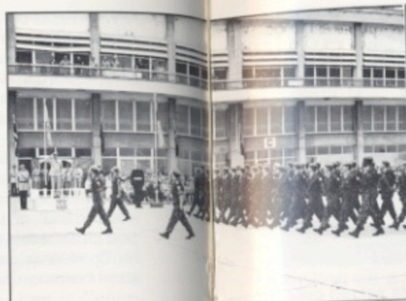
O Battery, The Rocket Troop