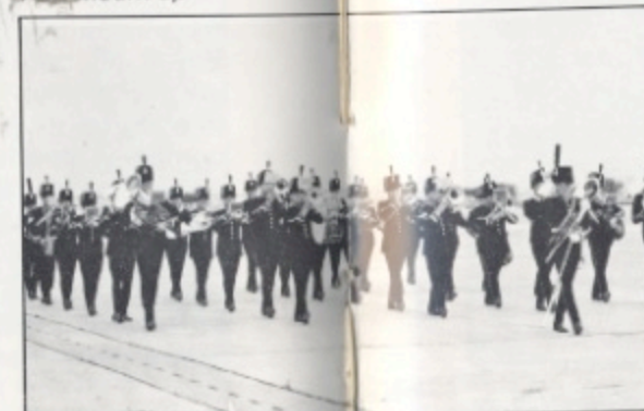
The Royal Artillery Alanbrooke Staff Band