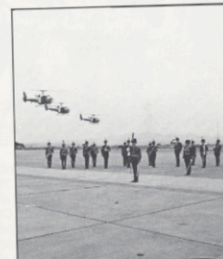
Helicopter Fly Past