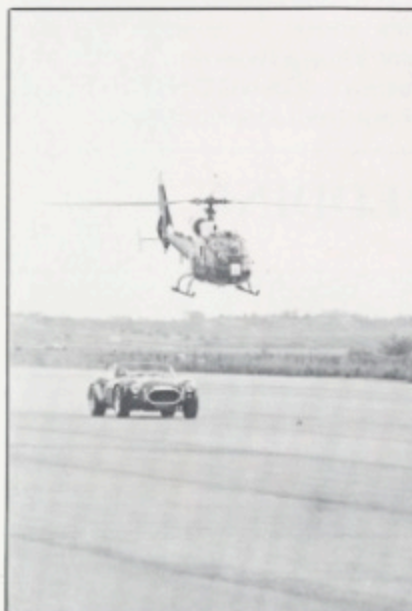
Cobra V Gazelle