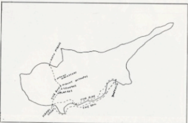
Trans Cyprus Challenge route