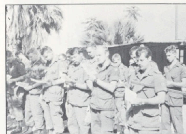
Kapyong Day memorial parade at Wolsely Barracks Cenotaph, 25 Apr 90

ing hard for the play off positions which will lead to capturing the title of "BBC World Series Champions Snowgoose Rotation 53". What are the predictions? Those on the inside say that the Sr NCOs are a good bet for the final, but the officers and JRC team, 1st place, look ready to give them a good fight. Alright everyone, play ball!