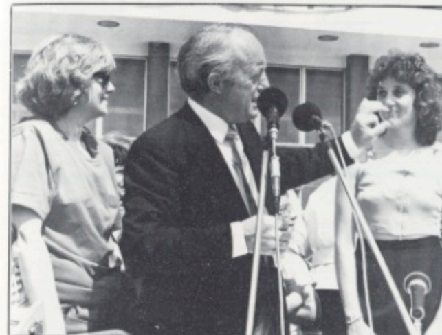
Paul Daniels performing magic