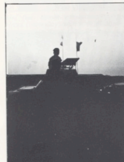
Ferret Scout Car Sqn