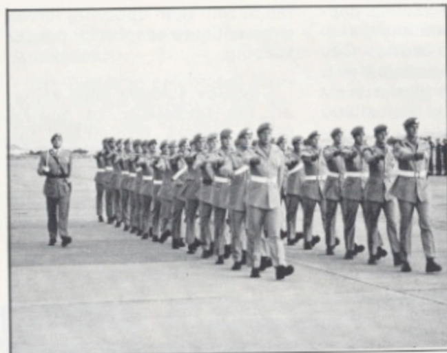
BRITCON Medal Party