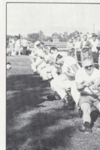
The SWEDCIVPOL team