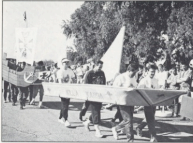
The AUSTCIVPOL crew at the start of the boat race.