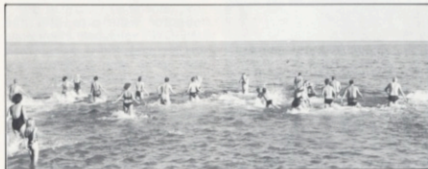
The crowd running into the sea