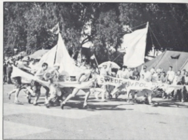
HMS Flapcon (SDC Sect 2), and The SS (SWEDCIVPOL).