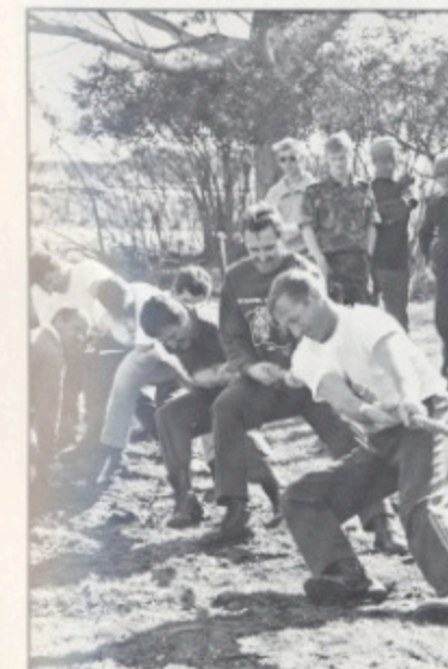
The AUSTCIVPOL Tug-of-War team.