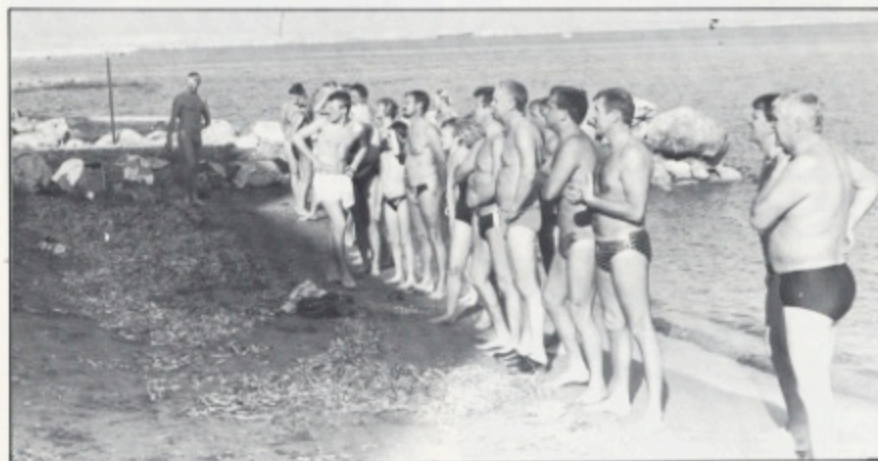
The gathering before the swim.