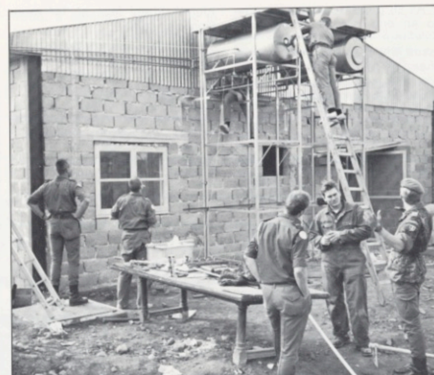
The Kitchen in its final stages of completion in December 1989.

The interior of the kitchen was completed on 19th December 89 and was used for the first time that evening - a red letter day for the company far away from everything and everybody.