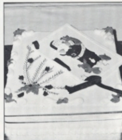
The Master Chef's masterpiece