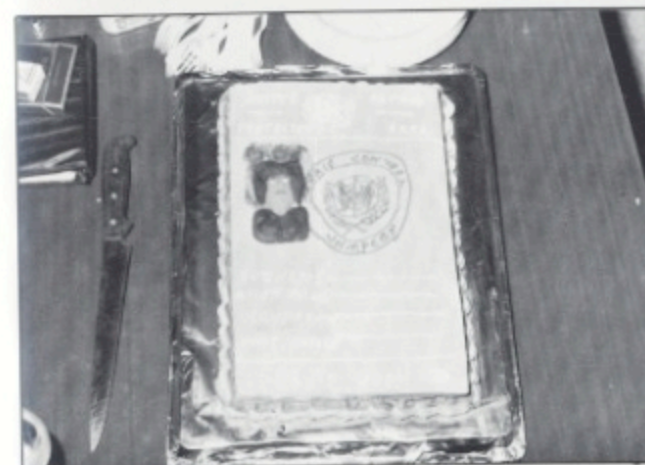
The CANCON kitchen does an excellent job in creating a false UNPA pass (cake).

To underscore the many hours of overtime—some benevolently, (CAO to note) and the patience as well as the understanding shown throughout the completion of this project, the involved Coy personnel got together on 8 Dec 89 for a little cake and bubbly.