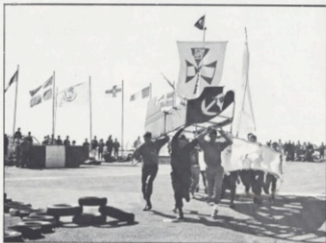
HMS Jiffcon (Ord Det) in action.