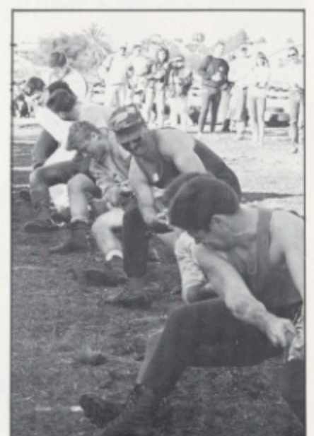
The CANCON team.