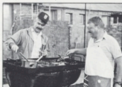
The Canadians provided the BBQ.