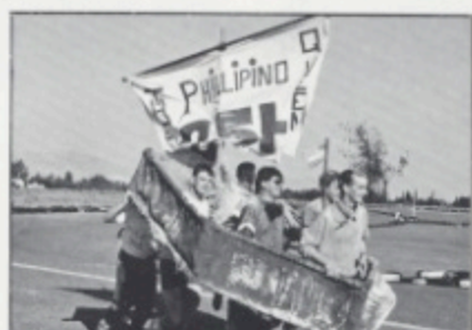
Phillipino Queen (254 Sig Sqn).