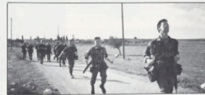
... and after!