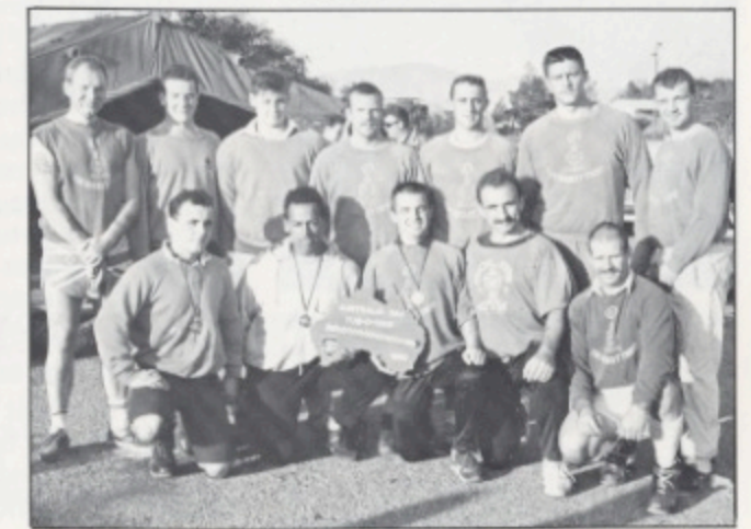
Tug-of-War winners O' Bty, Sect 2.