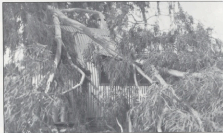
Storm damage at Camp Duke Leopold V.

The AUSCON engineers, probably one of the busiest platoons in the sector are on call 24 hours a day, 7 days a week and are comprised of 19 men who are electricians, bricklayers, locksmiths, plumbers and carpenters under the command of 3 NCOs and 1 officer. Beside the installation and repair work their main task at the moment is building living quarters in the camp and along the Buffer Zone.