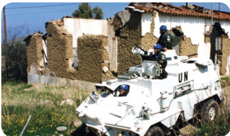
On patrol in Sector 1.