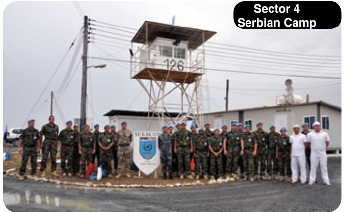
Sector 4 Serbian Camp