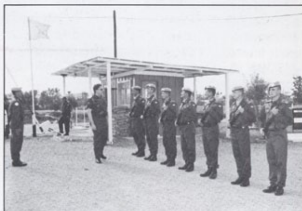
Guard of Honour in Camp Izay

The selection of personnel started in June 1997 on a voluntary basis with a number of officers taking part in an international peace-keeping course.