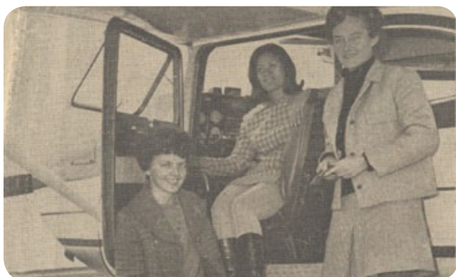
Civilian staff serving with UNFICYP in the 1960s.