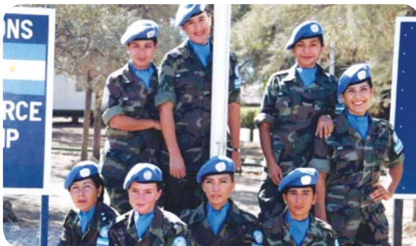
Argentina has always supported the United Nations' efforts to increase the participation of women in peacekeeping.