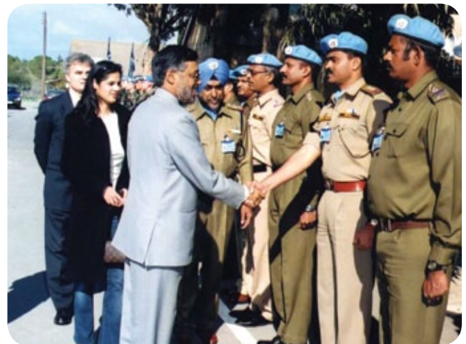
The Indian High Commissioner greets Indian Police at UNFICYP HQ, 2004.