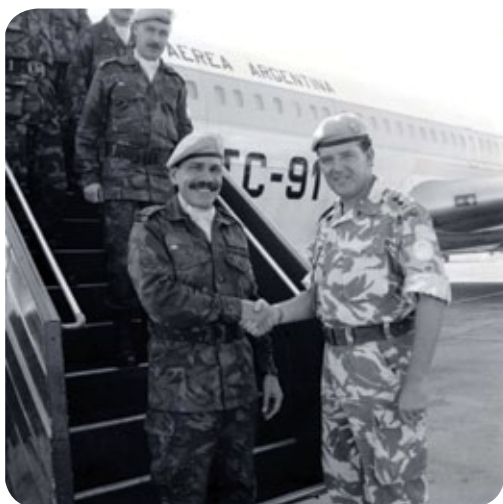
Lt Col Durante leads the arrival of the first Argentinean Blue Berets in Cyprus

In 2013, Argentina marked 20 years of peacekeeping in Cyprus, a milestone that reflects its national philosophy of supporting peace missions. This commitment has led 40,000 Argentinean peacekeepers to deploy with the UN since 1958.