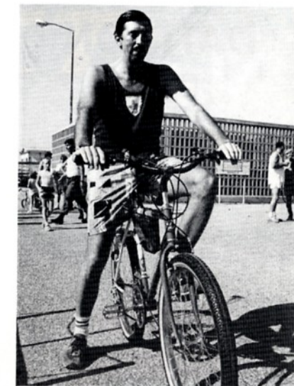
Some did it with their eyes closed.

The 7th October 89 dawns bright and clear the start of another Terry Fox Run in aid of cancer research. Runners, walkers, bikers, skateboarders, roller skaters and many more begin arriving at the Nicosia Airport terminal at around 0700 hrs. At 0800 and 0810 hrs, the timed runners begin the 10 km route followed by the fun runners, walkers etc. Approximately 850 participants and over £2,100 of $4,893 Cdn collected or pledged, both surpassing even last year's record totals. The work of many coupled with the generous donations of many more will eventually fulfil Terry's dream of ending the devastating toll that cancer takes from us each day. The organizers thank you for your participation.