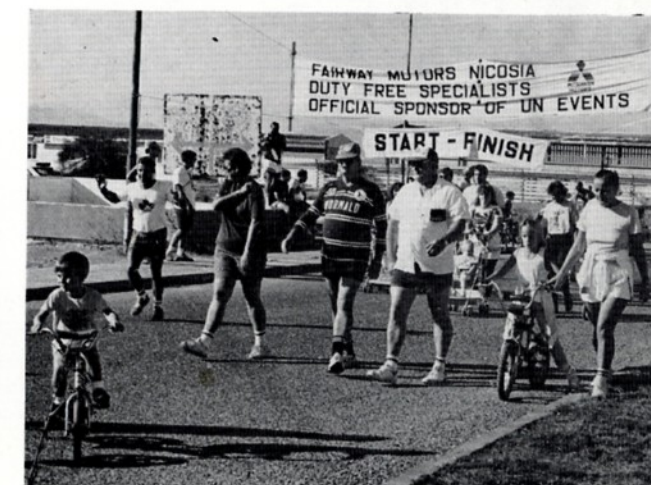
AUSTCIVPOL walked it.