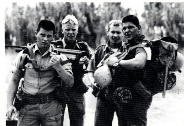
A welcome break.

On 3rd October the 3rd AUSCON Patrol March took place in the area of 2nd Coy. Nineteen teams had to prove their skills in kit recognition, map reading, signals, shooting and throwing hand grenades, on the 15km route from Ayios Nikolaos to OP A28. A medical station was set up at Ayia