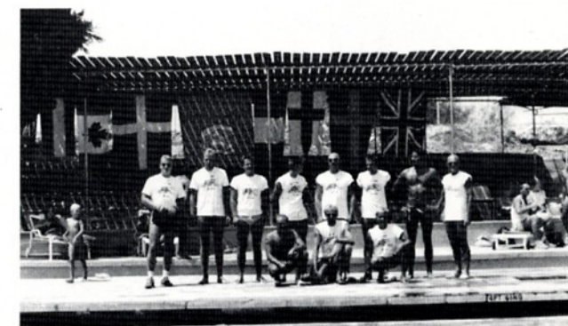
The DANCON team in the UNFICYP Swimming Gala.