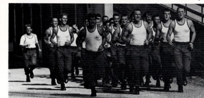
254 Sig Sqn did it in a squad.