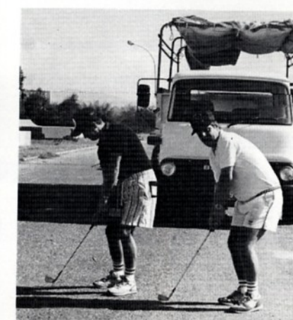
Some "putted" around.