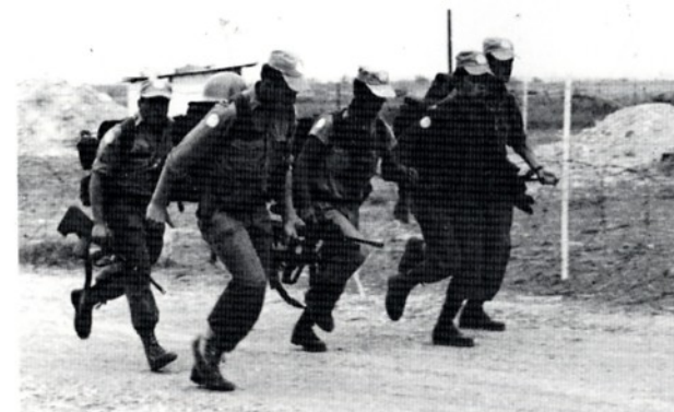
Members of AUSCON during the patrol march.

On 3rd October the 3rd AUSCON Patrol March took place in the area of 2nd Coy. Nineteen teams had to prove their skills in kit recognition, map reading, signals, shooting and throwing hand grenades, on the 15km route from Ayios Nikolaos to OP A28. A medical station was set up at Ayia