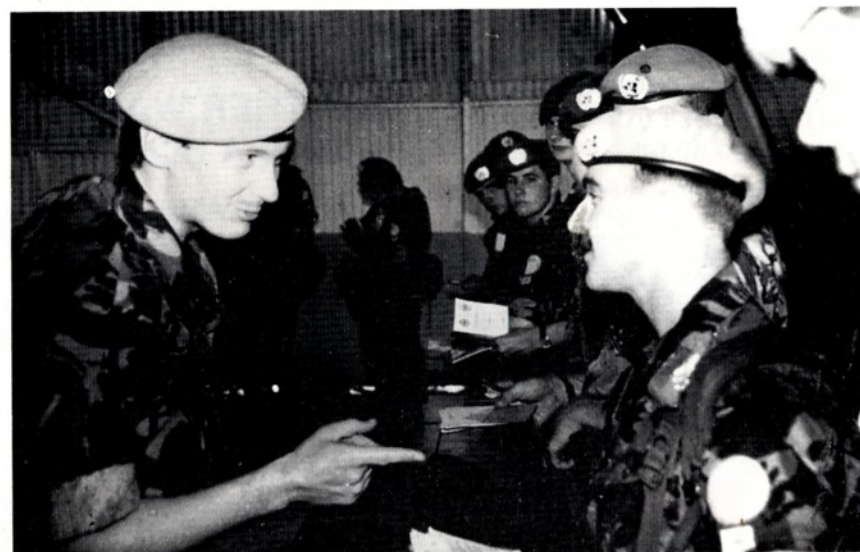
Adjutant 4RTR in a jovial mood.