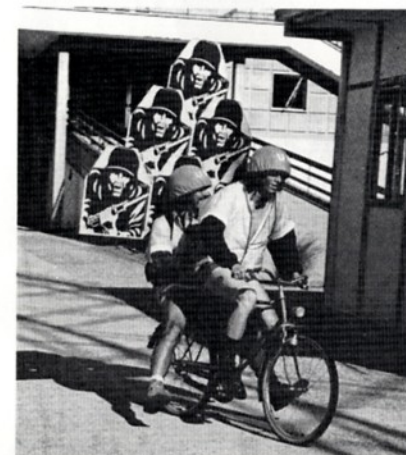
Some did it in-pairs?