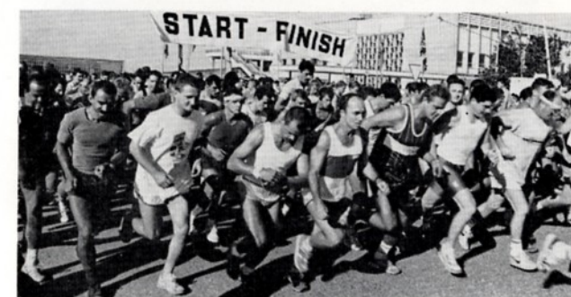
...and they're off!