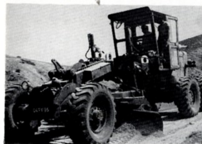
Under direction from LCpl Shute CBF gets to grips with a grader.