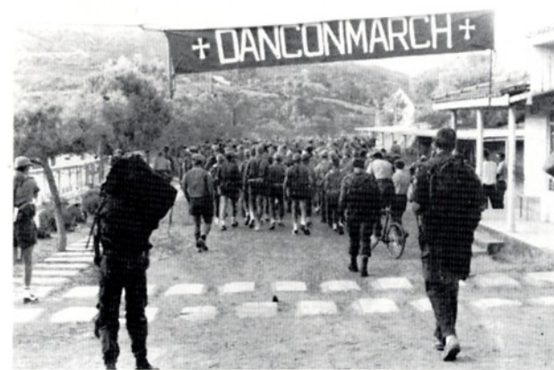
The start of the DANCON March.