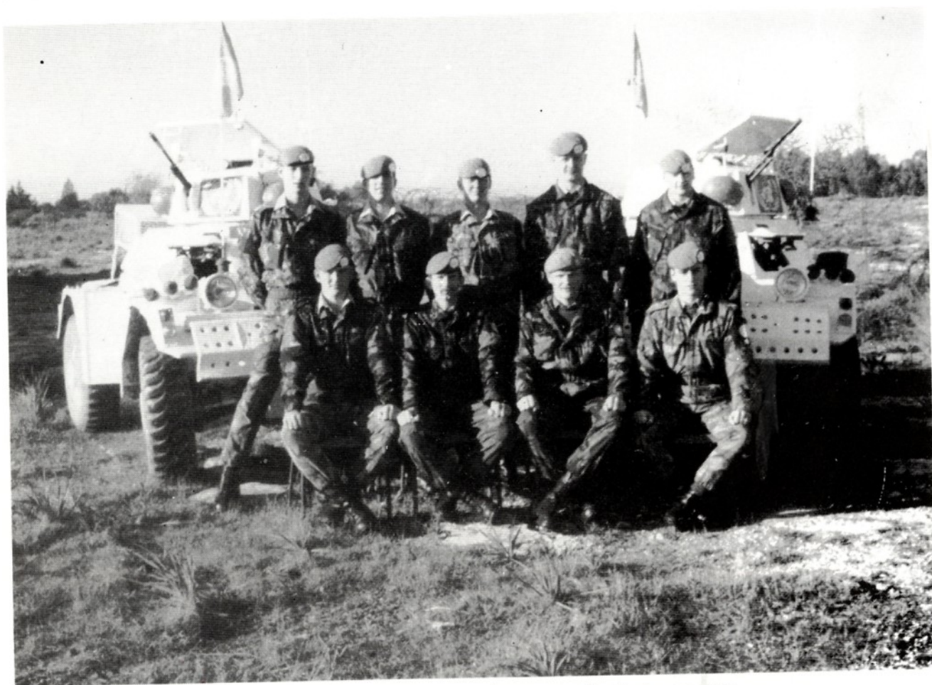
5 Troop. The Grenadier Guards prepare for their new role.