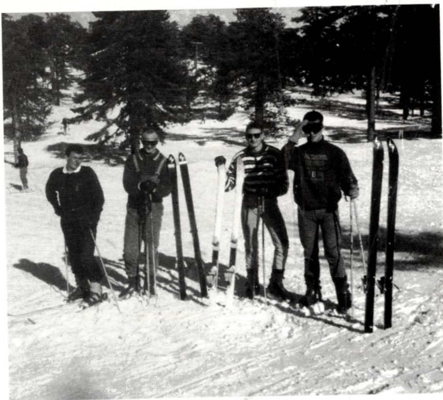
Time has already been found for skiing. Members of 5 Troop pose in the sun.

In the handover week patrols were carried out by composite troops, made up of Life Guards and 9/12 Lancers. This eased the task for our Troops consider-