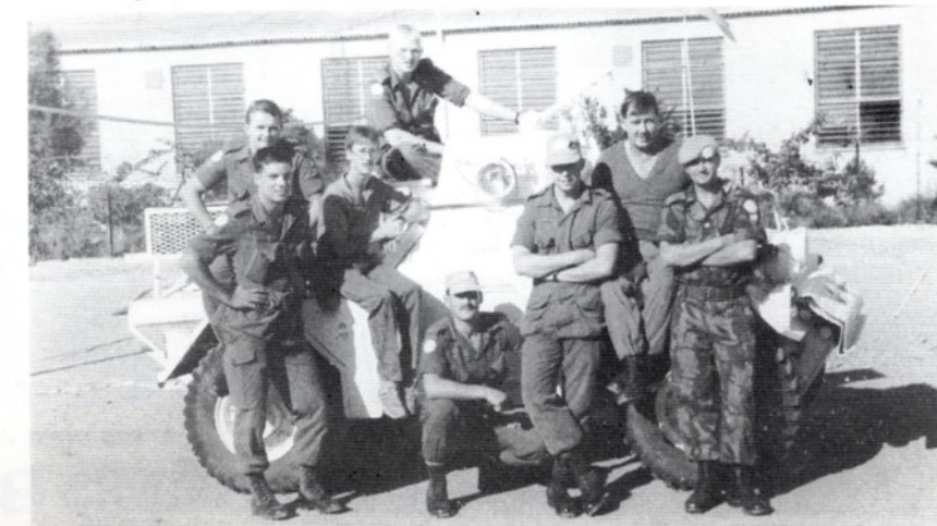
Canadians huddle around a British Ferret Scout Car