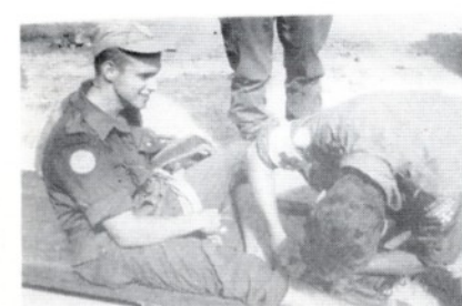
Danish medical team aids a soldier during the DANCON March

Our tour has been exciting and it has been one of the busiest in the years. But thanks to all of you, we have been able to complete all tasks to a very high standard.