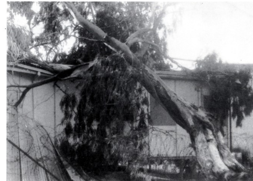
Storm damage in CDL V

At the moment they are working on a new washroom building with showers, new doors and windows for some of the OP's. Of course they still tackle the routine jobs such as checking gas pipes, electricity, hot water and leaking roofs.