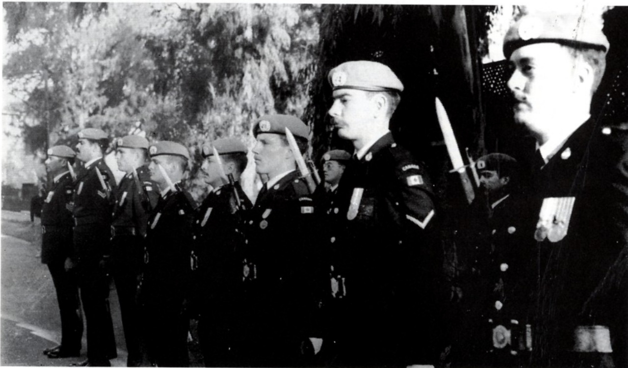
Saying Goodbye to Sector Three