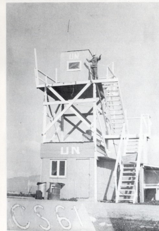
CS61 Falaise blew its top during a winter storm