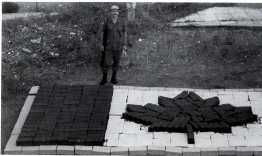
This flag has now been replaced with the Union Jack at BC21 orchard