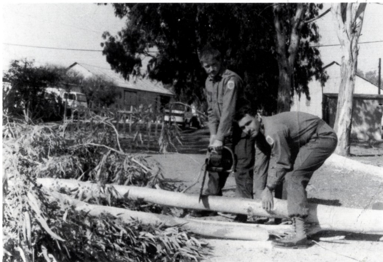
Clearing away a fallen tree

The January storms and heavy rainfalls uprooted several trees which in one case smashed a newly constructed building in AUSCON.