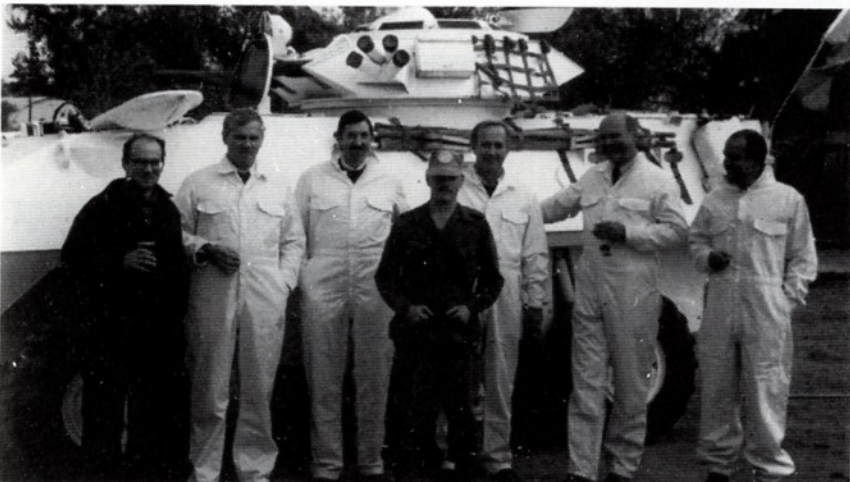
Strathcona's have mechanical faults on an APC checked by HQ UNFICYP's maintenance team!