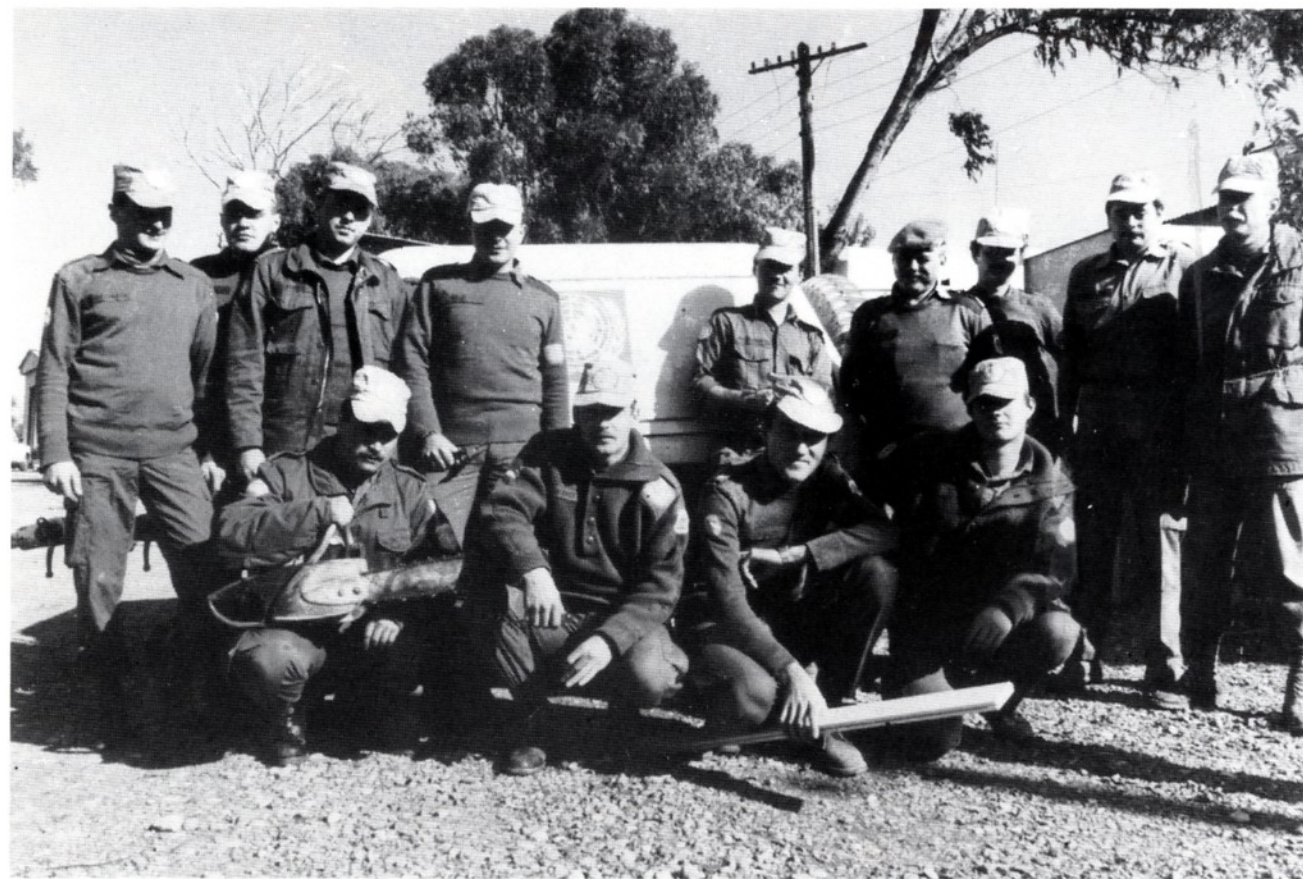
A rare sight – AUSCON engineers not working!