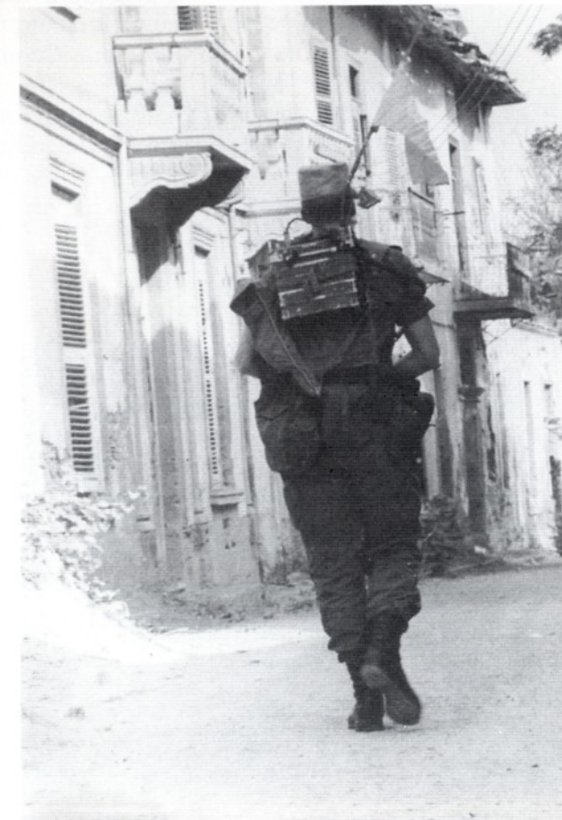
We will return!