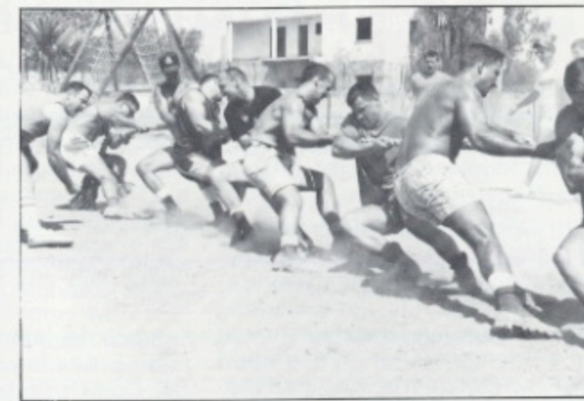
Rural Coy "digging in" during the Tug of War competition.