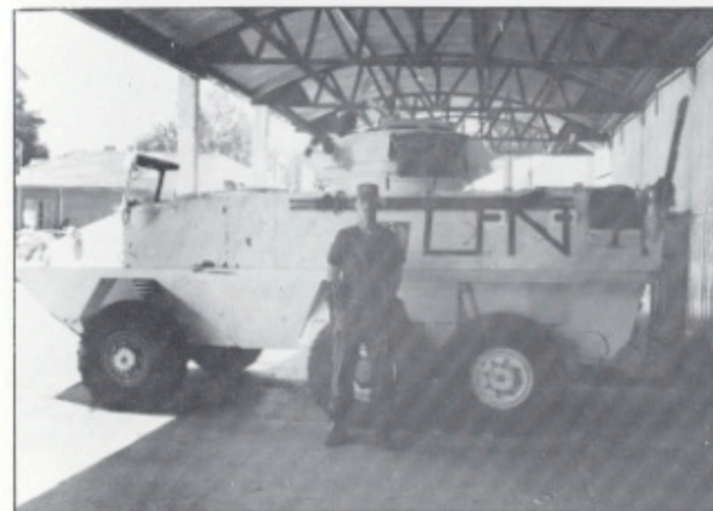
The ever adaptable Rural Coy Soldiers. Cpl Landry as a member of the Force Reserve Platoon.

Rural Company of Sector 3 is likely the most diverse area of any in UNFICYP. It covers the close, built up area of East Nicosia, through the wide open plains to the South and all the way down to the hills surrounding the Louroujina pocket.