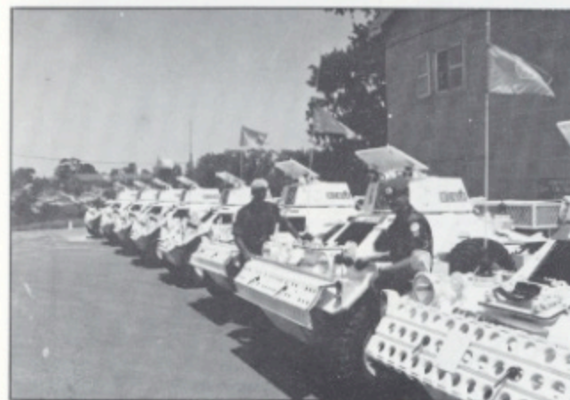
Elements of the Force Reserve from the newly arrived Ferret Scout Car Squadron - ready for "crashout".