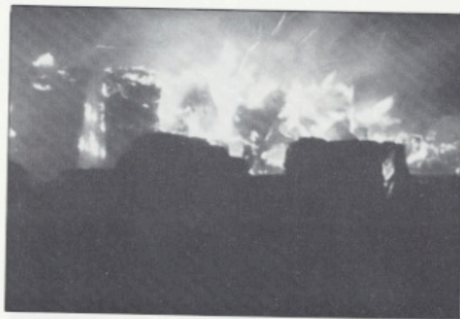
On 28th June a fire started 100 meters east of OPT-A-20 and due to strong winds it spread quickly. The fire was fought by fire brigades from