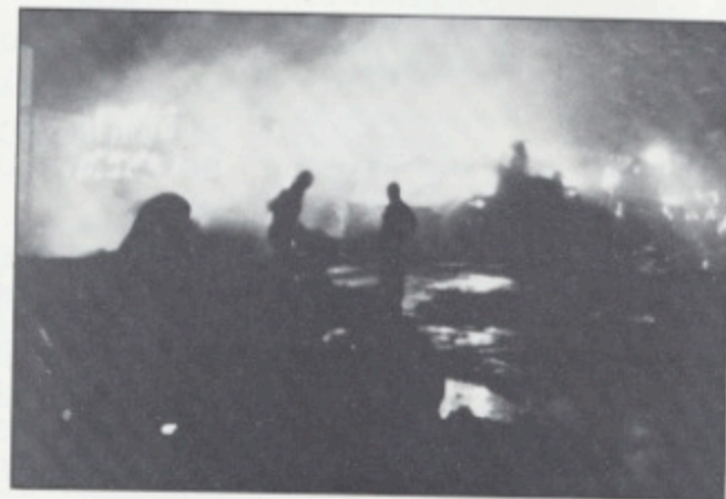
Ayios Nicolaos and Dhekelia and help was also given by Austrian soldiers. The blaze was finally extinguished on July 3rd.