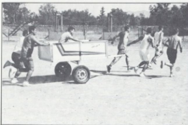
The Administration Coy winning entry in the Canada Day Chuckwagon Race.