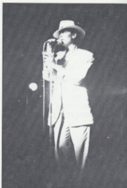
Dancing on the Ceiling '90 - What a show!

Well that's about all for general goings on in Sector Three over the past month. Until next time take care, enjoy the sun and above all, keep the peace!