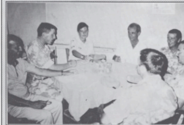
AUSTCIVPOL Officers attend village meetings with Sector Two Humanitarian personnel.

administrative and operational centre for the Contingent. Here, the majority of the Contingent are housed and the accommodation includes kitchen and recreation facilities. The main communications centre is also located there.