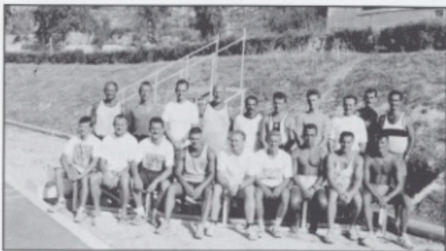
The UNFICYP Athletics Team

At the close of a successful athletics season, UNFICYP athletes won the British Forces Cyprus Minor Units team trophy, were runners-up in the Cyprus Services Athletics League (CSAL), providing several individual champions, and came second in the annual triangular match with the ESBA and WSBA. Considering the limited resources of Sp Regt, the overall results were admirable. Well done lads!