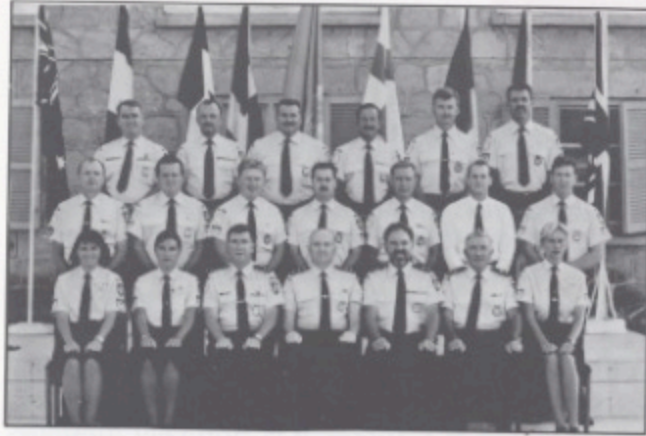
Group photograph of medal recipients