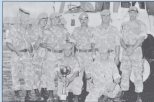
Overall team winners: Sig Sqn, Sp Regt

In conclusion, this was an event with variety and challenge which appeared to be enjoyed by all who participated. It is hoped that the skills which earned the prizes fiercely contended for during the event will prove to be the virtues which will promote safer and more skilled driving during our operational tasks.