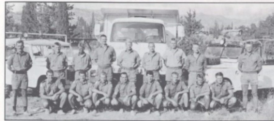
The DANCON Engineer Section

"God helps those who help themselves" (and so do the Engineers!)