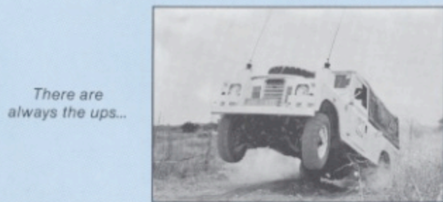
There are always the ups...