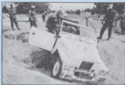
...and the downs...