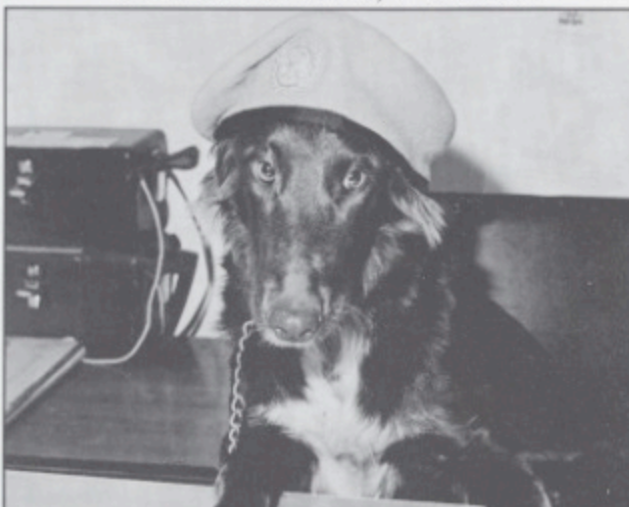
Is this a possible solution to UNFICYP's financial problems, or just a case of it being a dog's life as the ALO?